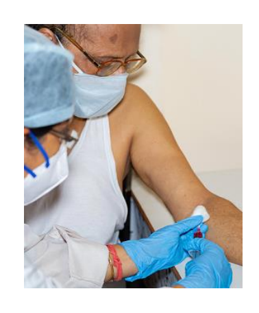
Aplisol ® (tuberculin PPD, diluted)