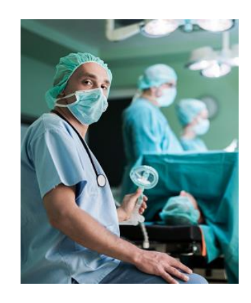
Ephedrine Dexmedatomidine Phenylephrine Neostigmine