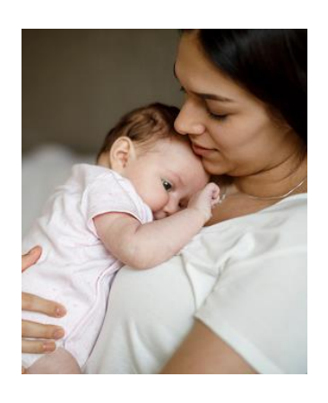
Pitocin® (oxytocin injection, USP)